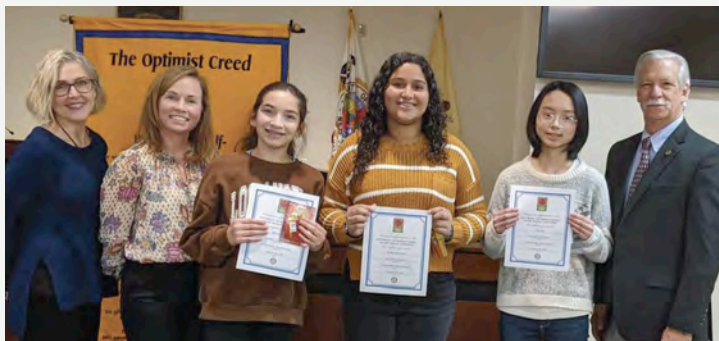
Essay Contest Winners

The Howell Alliance congratulates this year's Howell Optimist Club essay and oratorical contest winners from the Howell Township Public School District and Farmingdale Borough School District!