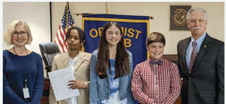
Oratorical Contest Winners

For the 2022-2023 contest, an impressive total of 76 essay entries and 32 speech entries were submitted. Two Optimist Club of Howell oratorical winners and one essay winner advanced to the district competition, with district-level contest winners having the opportunity to go on to compete in Optimist International's regional and international contests.